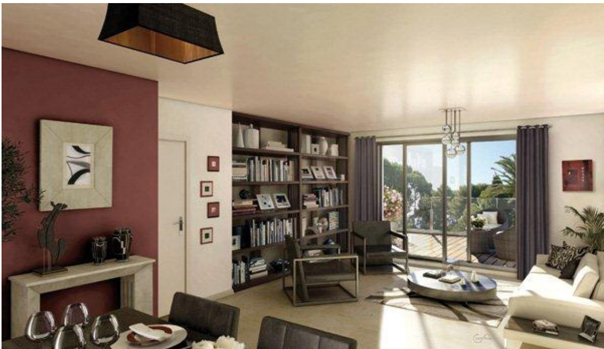
Contemporary Finishes & Fully Equipped Kitchens