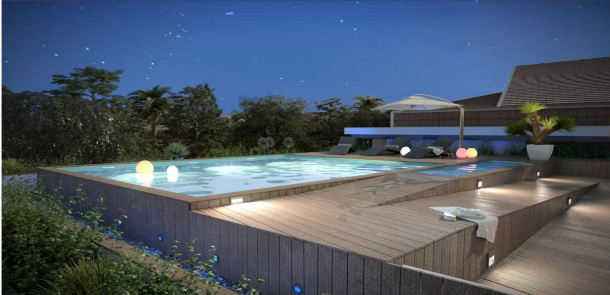
Roof Top Swimming Pool

Good to Know: Whether you prefer a morning or evening swim, each of the residence's two swimming pools invite you to take a dip whenever you fancy. You long for the sand and the sea? The beaches of la Croisette are but a 5 minute drive away . Tennis anyone? The closest courts are just 2 km away and the superb Cannes Garden Tennis Club is only about a 10 minute drive . If you're looking for a fairway or a putting green, you can be at the Royal Mougins Golf Club in 15 minutes