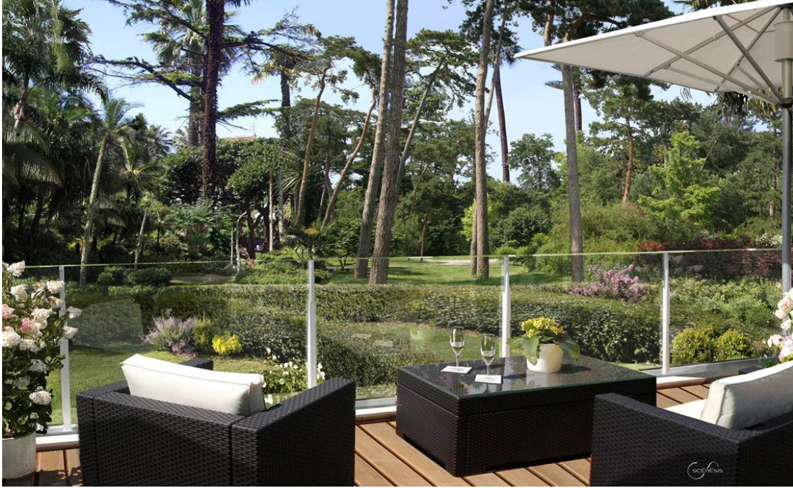
Large Balconies, like an external Living Room