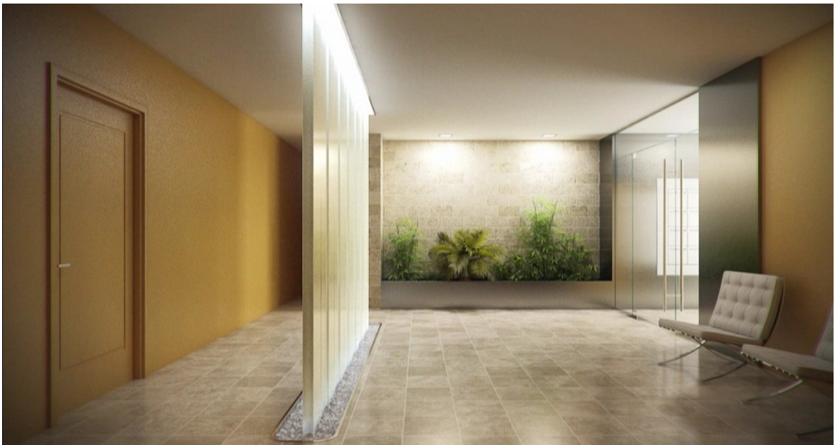
24 Hour Security & Porter