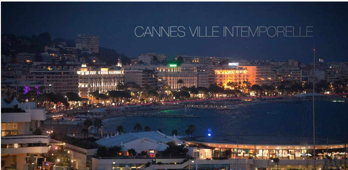
Glitz & Glam only five minutes away