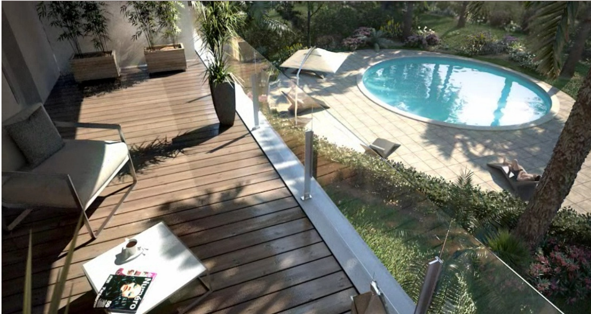
Savour the Luxury and Beauty of living in the heart of a hundred-year-old park