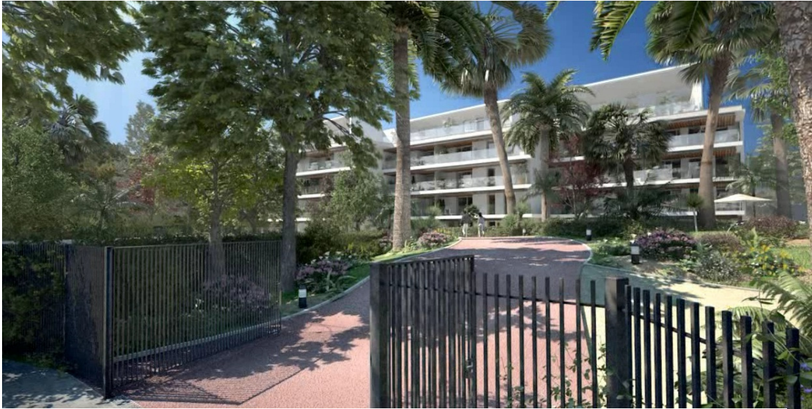
Luxury Inside and Outside