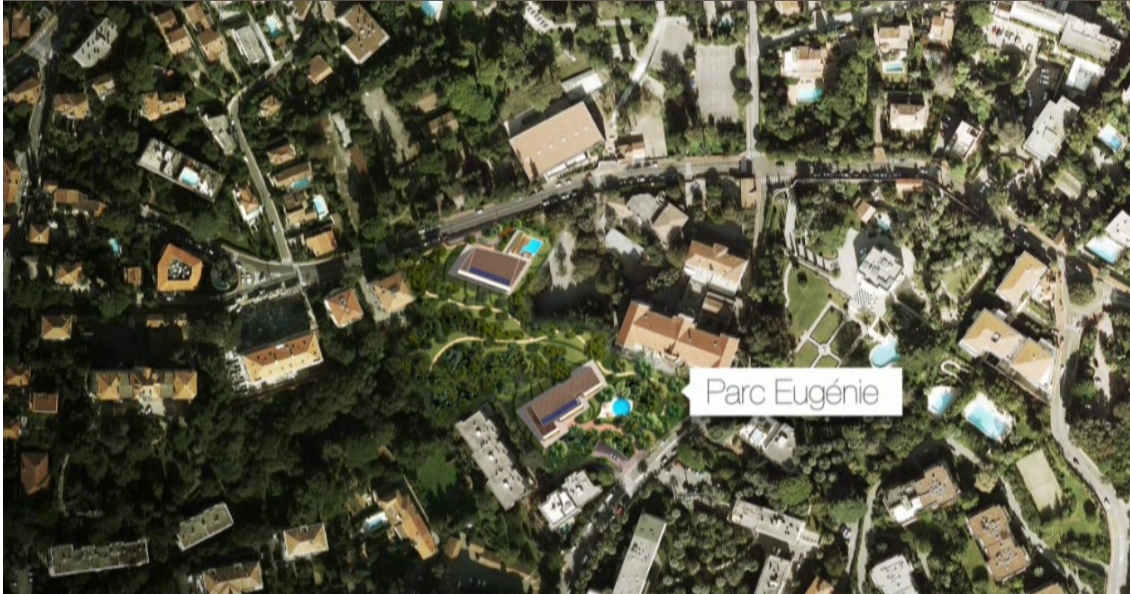
Peace & Tranquillity at the heart of Cannes