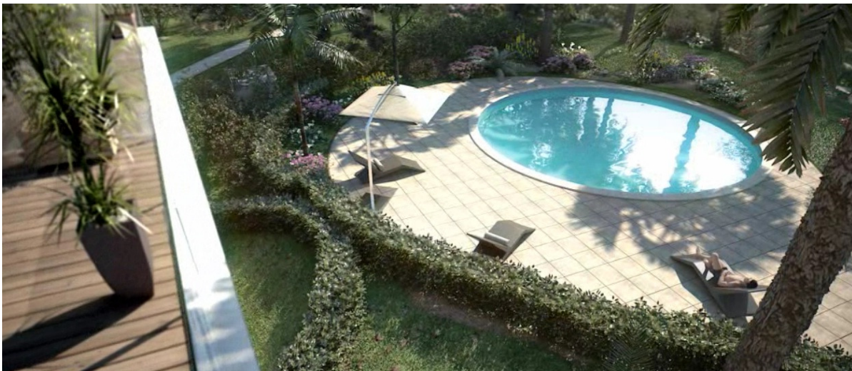
Day Time Swimming with superb views of the Park

Good to Know: Whether you prefer a morning or evening swim, each of the residence's two swimming pools invite you to take a dip whenever you fancy. You long for the sand and the sea? The beaches of la Croisette are but a 5 minute drive away . Tennis anyone? The closest courts are just 2 km away and the superb Cannes Garden Tennis Club is only about a 10 minute drive . If you're looking for a fairway or a putting green, you can be at the Royal Mougins Golf Club in 15 minutes