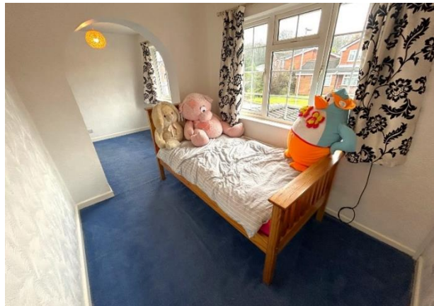
BEDROOM THREE: Rear double bedroom with built in wardrobes, radiator and UPVC double glazed window to the rear.