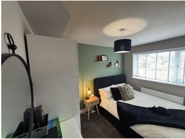
BEDROOM THREE : Rear double bedroom with carpet, radiator and double glazed window.