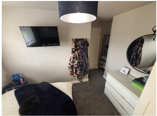
BEDROOM FOUR : Fourth, small double bedroom with carpet, radiator and double glazed window to the rear.