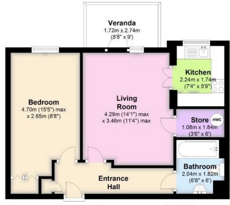
Total area: approx. 44.2 sq. metres (475.6 sq. feet)

Approx. 44.2 sq. metres (475.6 sq. feet)