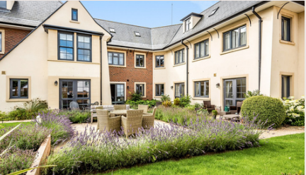
Clockwise | View over the bowling green | Communal lounge | Landscaped gardens