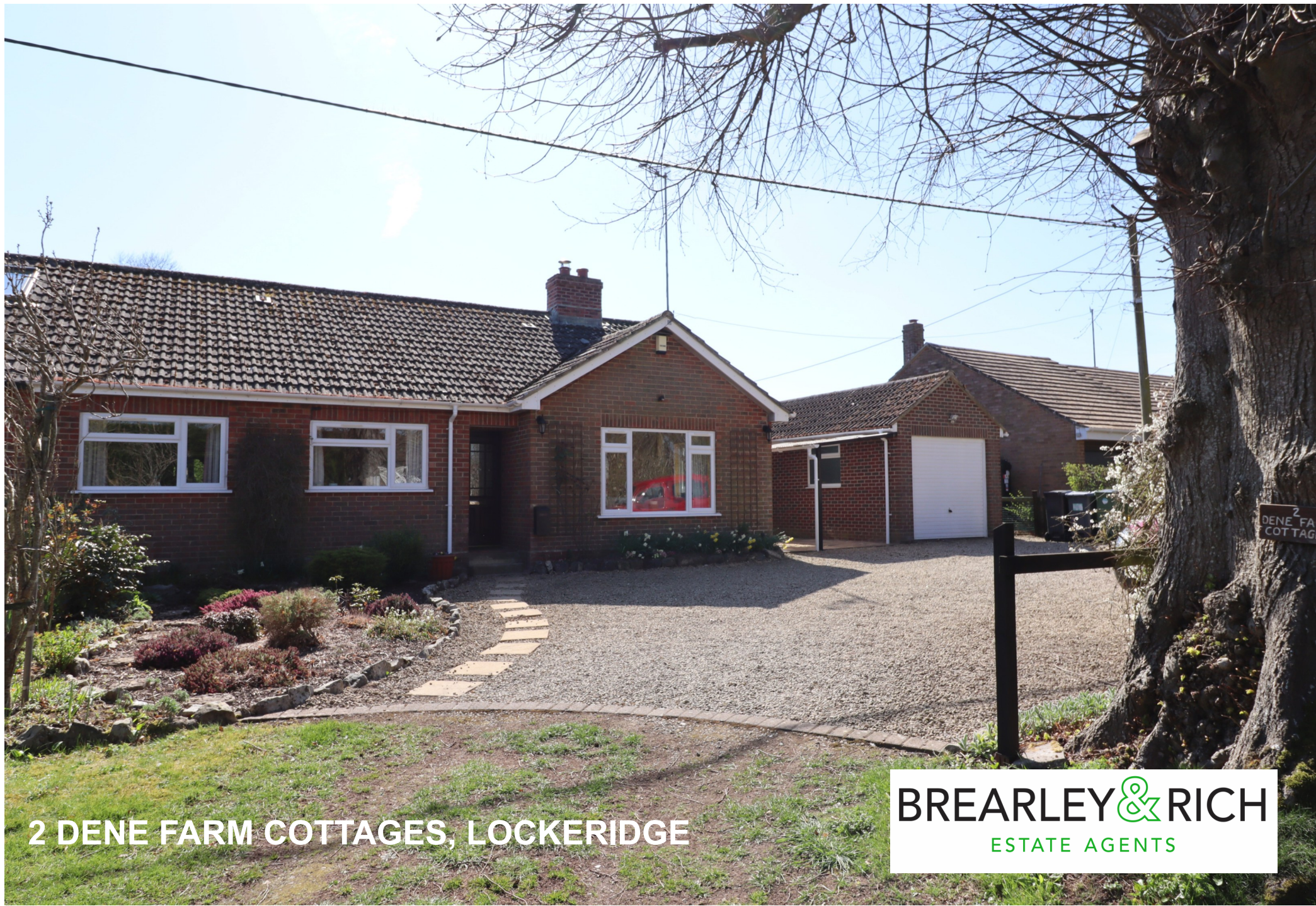
2 DENE FARM COTTAGES, LOCKERIDGE