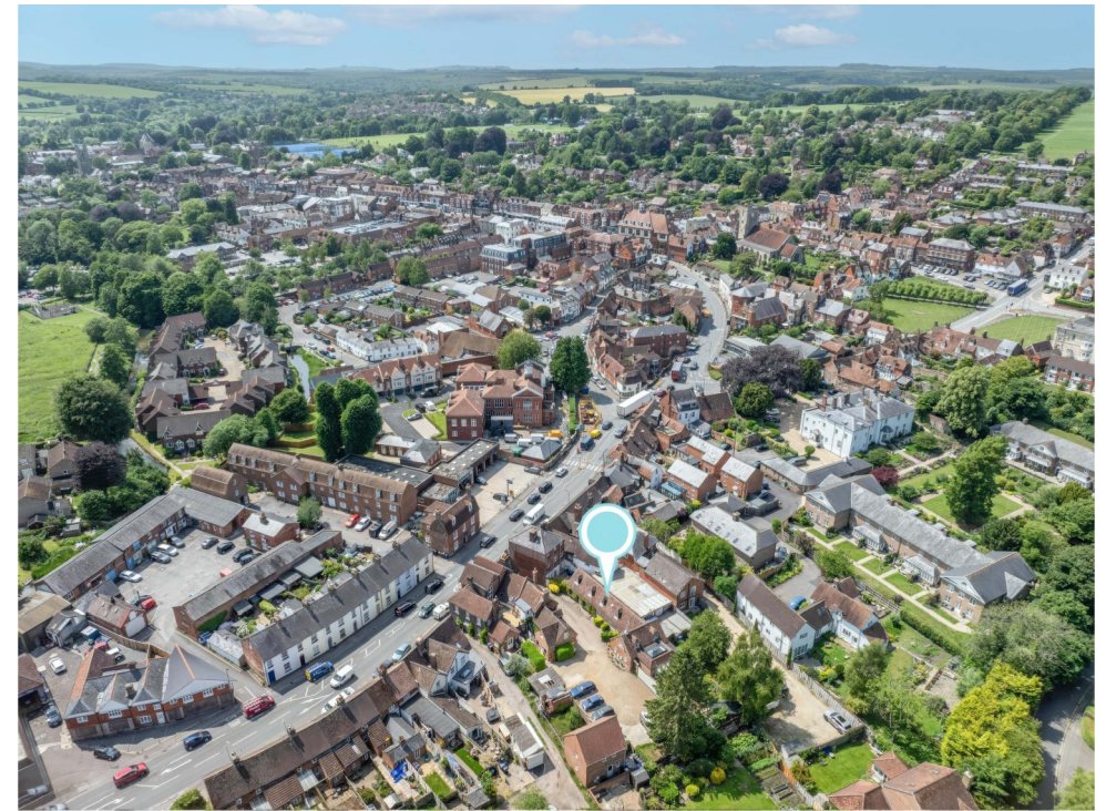
Illustration for identification purposes only, measurements are approximate, not to scale. Fourlabs.co © (ID1223367)