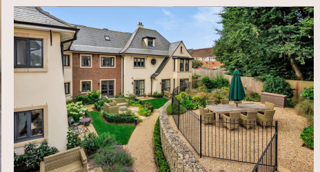
Clockwise | Dining Room / Bedroom 2 | Landscaped Gardens | Communal Lounge | Landscaped Gardens