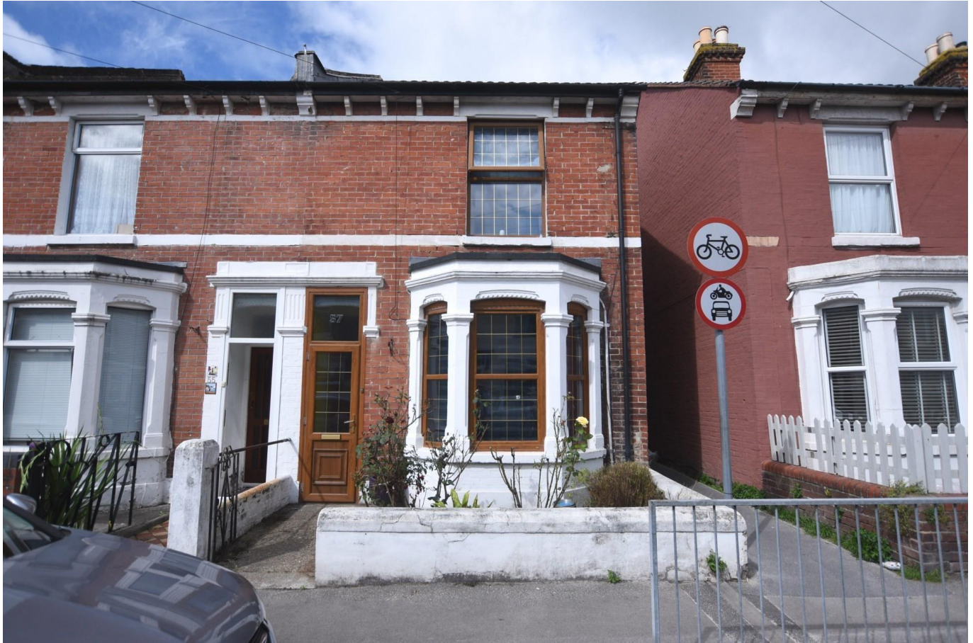
Elmhurst Road, Gosport, Hampshire, PO12 1PQ £250,000 Freehold