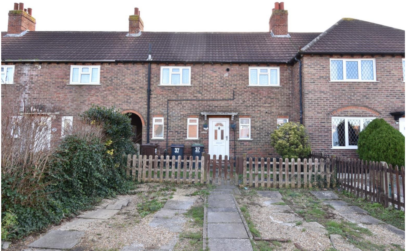
Greenway Road, Elson, Gosport, Hampshire, PO12 4RG £237,000 Freehold