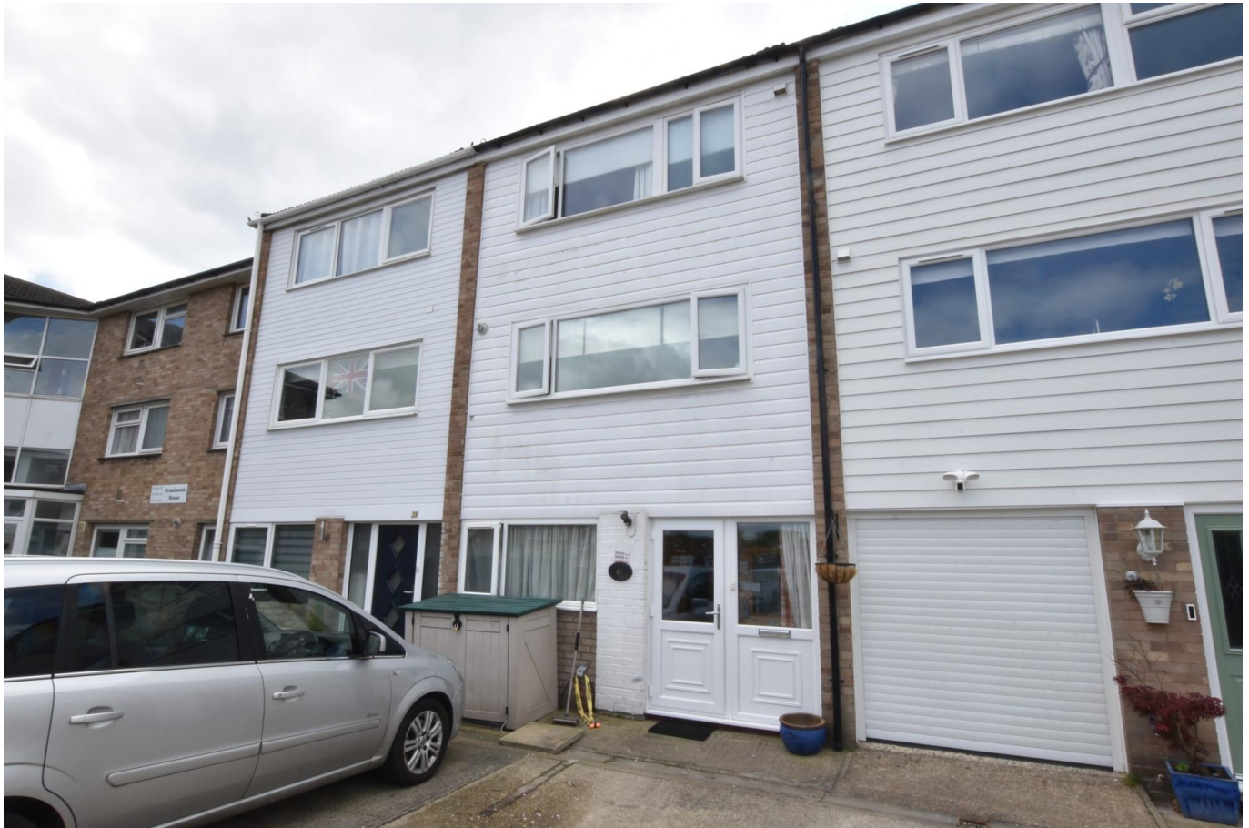
Broadsands Drive, Gomer, Gosport, Hampshire, PO12 2SB Offers In Excess Of £290,000 Freehold