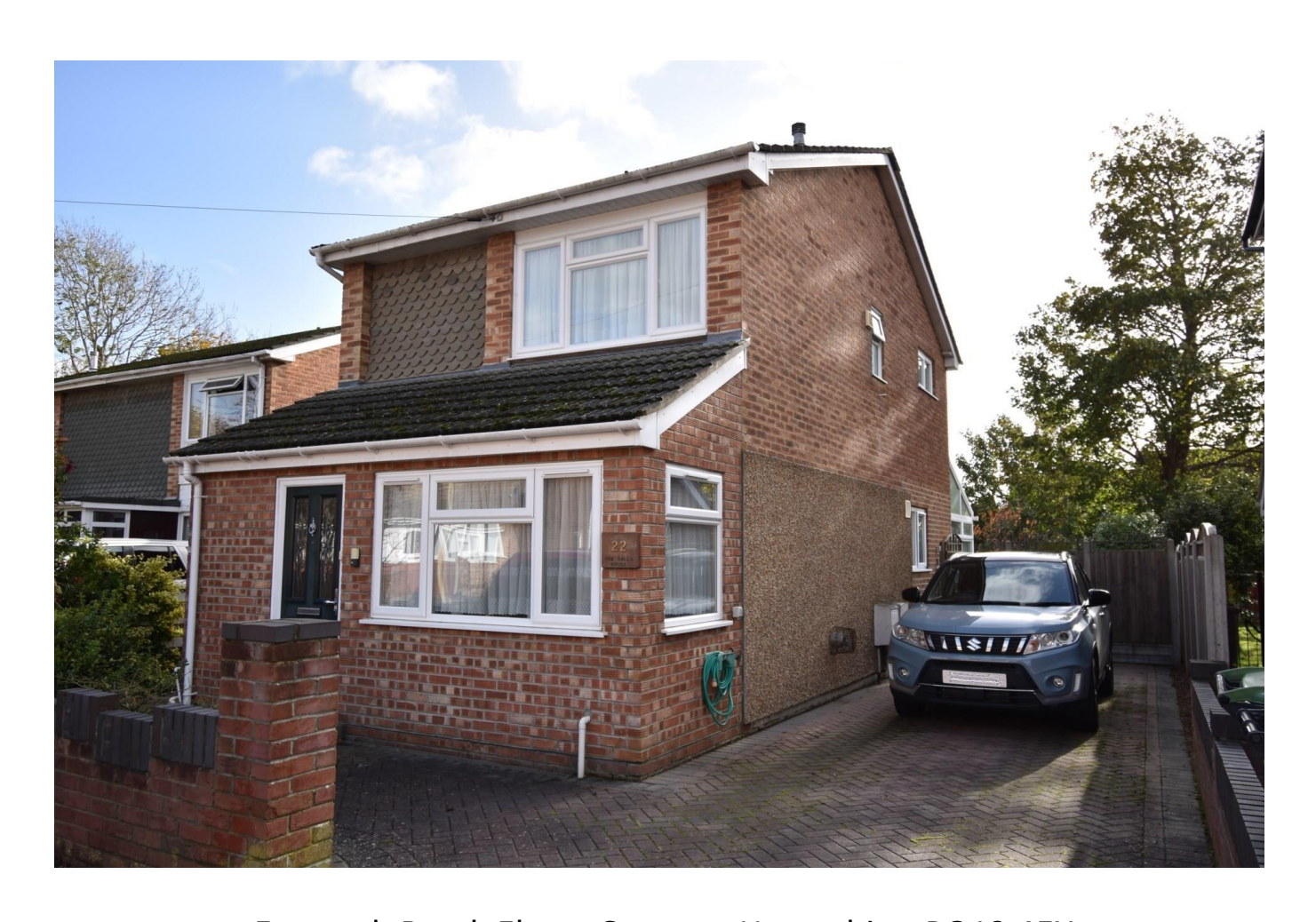
Exmouth Road, Elson, Gosport, Hampshire, PO12 4EX £330,000 Freehold

office@dimon-estate-agents.co.uk 6 Stokesway, Stoke Road, Gosport, Hampshire. PO12 1PE