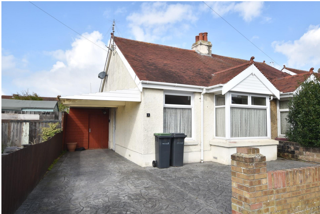
Northcroft Road, Gosport, Hampshire, PO12 3DR £235,000 Freehold