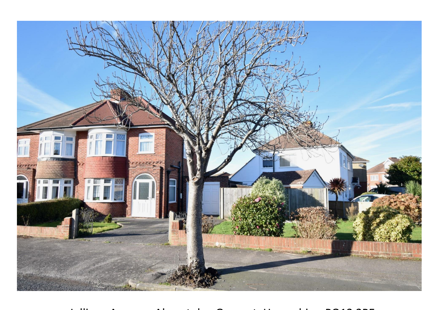
Jellicoe Avenue, Alverstoke, Gosport, Hampshire, PO12 2PE £350,000 Freehold

office@dimon-estate-agents.co.uk 6 Stokesway, Stoke Road, Gosport, Hampshire. PO12 1PE