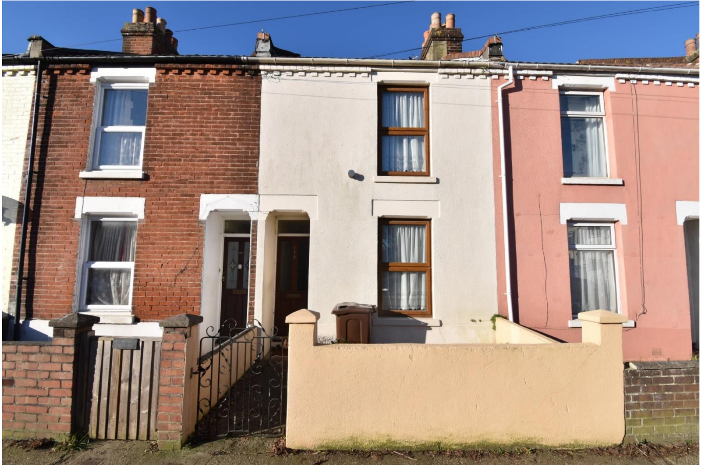
Whitworth Road, Gosport, Hampshire, PO12 3NW £190,000 Freehold