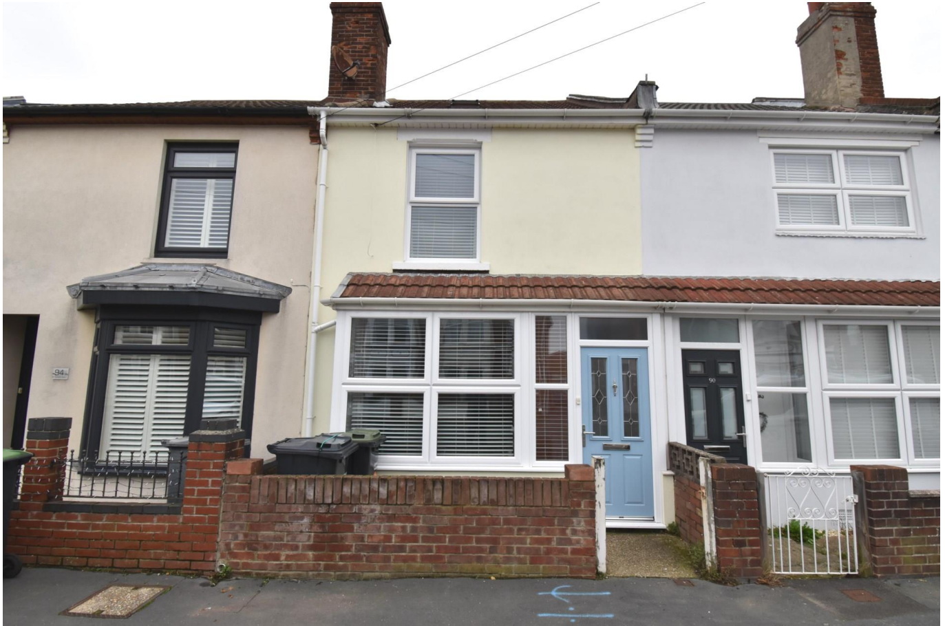
St Thomas's Road, Hardway, Gosport, Hampshire, PO12 4JX £264,500 Freehold