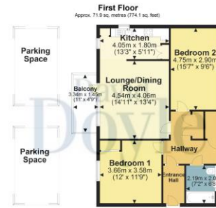
Total area: approx. 71.9 sq. metres (774.1 sq. feet) Proportion is not to scale and is to be used for general guidance only. Any measurements shown should NOT be relied upon. Floor Area (sqm) includes all areas shown on plan except Entrance Porch, Balcony, Terrace and Parking. Measurements are approximate. Plan produced using Planity.

Spacious and well presented two double Bedroom first floor apartment located on this sought after modern development and built in 2014. Lounge Dining Room with French doors opening on to a covered Balcony. Fitted Kitchen. Bathroom. Two allocated parking spaces.