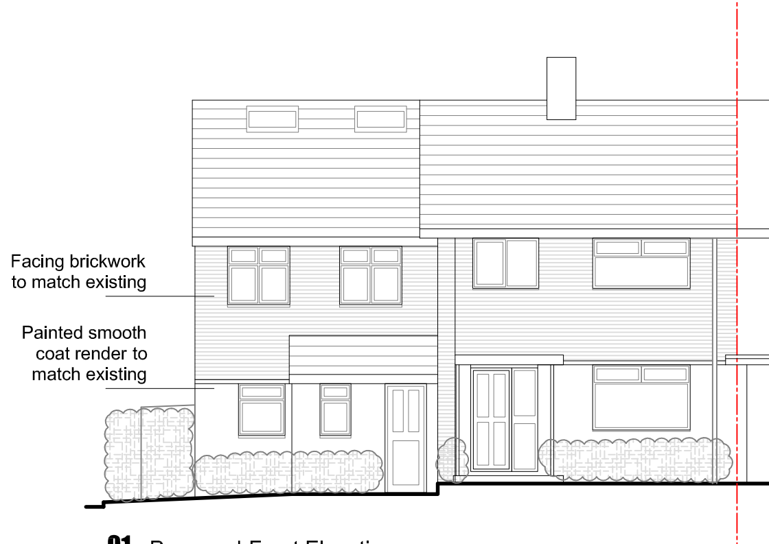
01 Proposed Front Elevation Scale 1:100

THIS DRAWING IS COPYRIGHT PRIOR TO COMMENCEMENT OF WORKS ON SITE AND DURING ANY OPENING UP WORKS ALL DIMENSIONS AND DETAILS OF EXISTING STRUCTURE TO BE CHECKED, LINGWOOD DESIGN AND STRUCTURAL ENGINEER TO BE NOTIFIED OF ANY OMISSION OR ERRORS. ALL DRAWINGS AND INFORMATION TO BE READ IN CONJUNCTION WITH STRUCTURAL ENGINEER'S DRAWINGS AND SPECIFICATION ALL CONSTRUCTION DETAILS TO BE APPROVED BY LOCAL AUTHORITY PRIOR TO COMPLETION OF WORKS ALL WORKS TO BE COMPLETED IN LINE WITH NHBC BEST PRACTICE UNLESS OTHERWISE AGREED