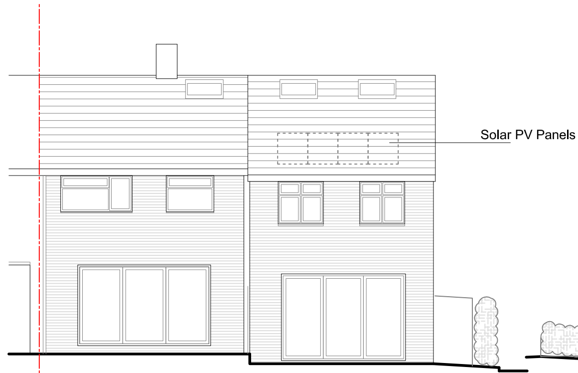
03 Proposed Rear Elevation Scale 1:100