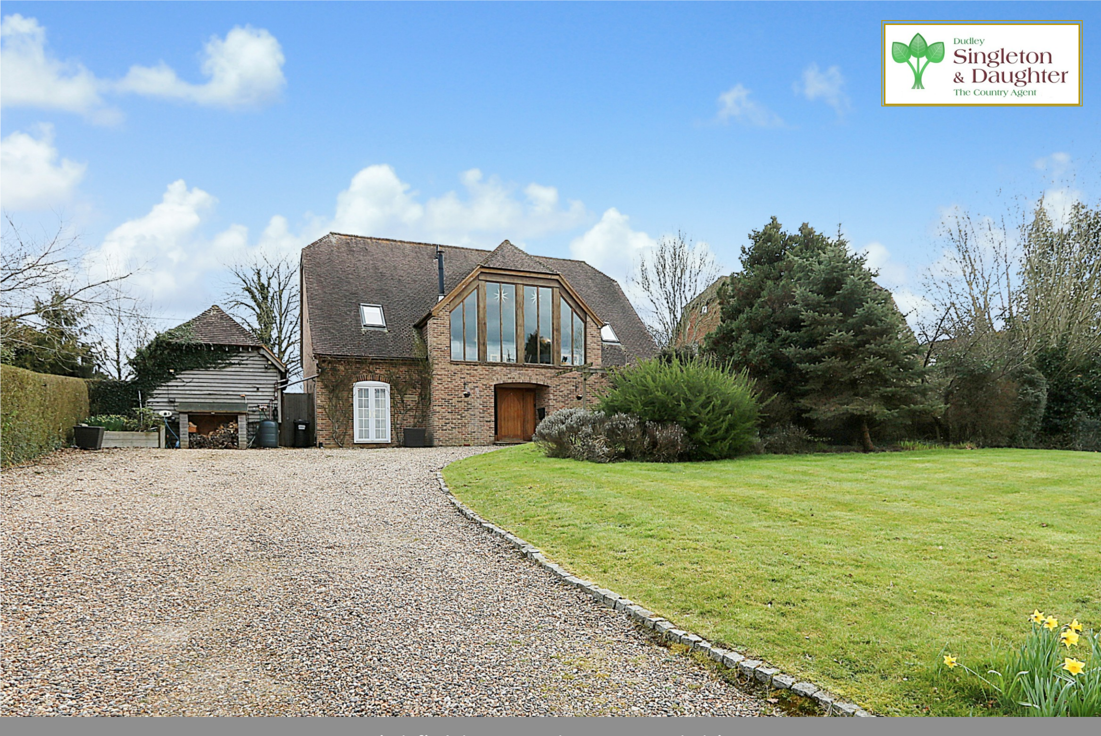
Highfield • Beenham • Berkshire