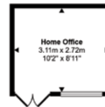
Home Office Approx 8 sq m / 91 sq ft

This floorplan is only for illustrative purposes and is not to scale. Measurements of rooms, doors, windows, and any items are approximate and no responsibility is taken for any error, omission or mis-statement. Icons of items such as bathroom suites are representations only and may not look like the real items. Made with Made Snappy 360.