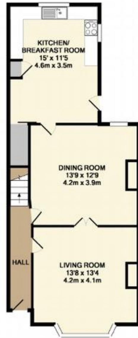
GROUND FLOOR APPROX. FLOOR AREA 584 SQ.FT. (54.3 SQ.M.)