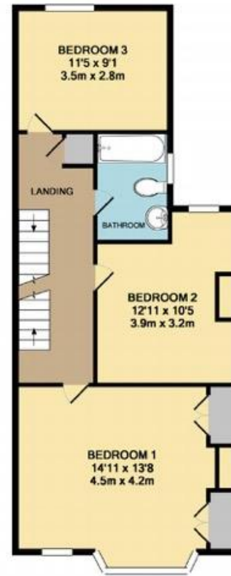
1ST FLOOR APPROX. FLOOR AREA 590 SQ.FT. (54.8 SQ.M.)