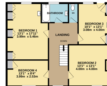
1ST FLOOR 851 sq.ft. (79.1 sq.m.) approx.