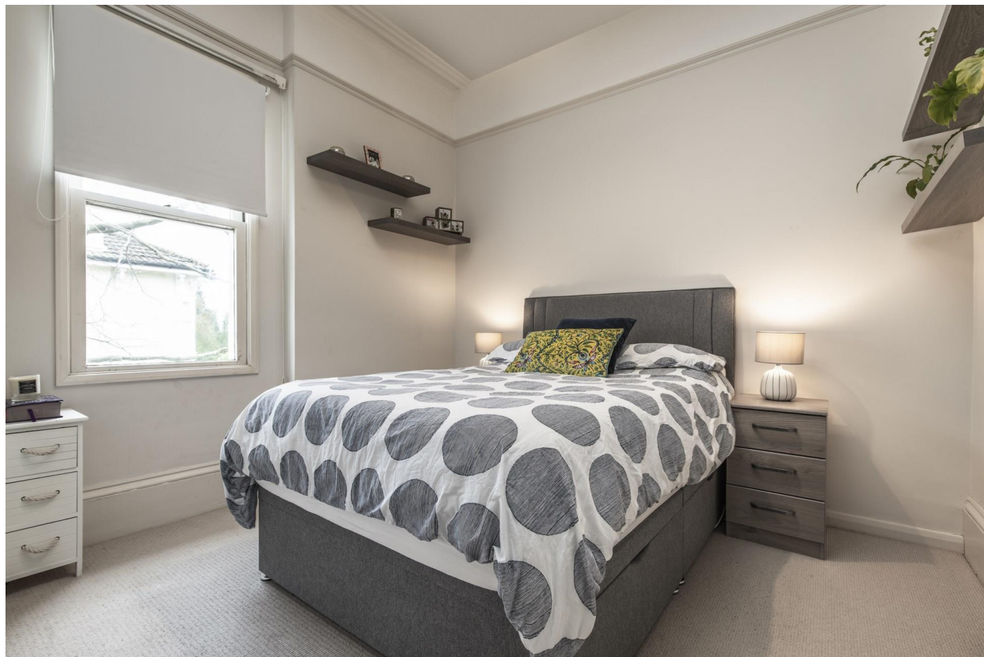
Bedroom 1: 9'11 x 9'11` side aspect sash window and radiator.

Bathroom: side aspect part opaque sash window, pedestal wash hand basin, low level WC, panel enclosed bath with wall mounted shower attachment, mixer tap and folding glass shower screen, part tiled walls, tile effect laminate flooring and radiator.