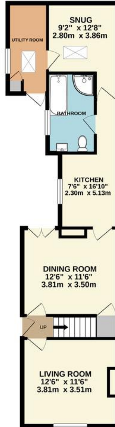
GROUND FLOOR 641 sq.ft. (59.6 sq.m.) approx.