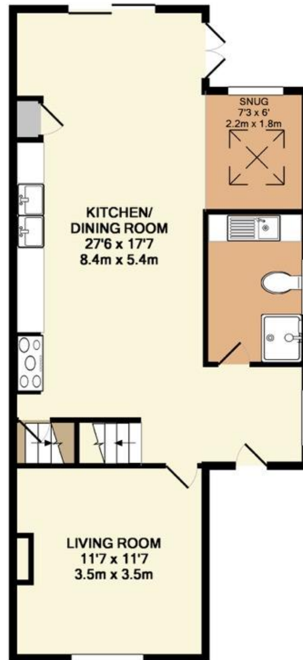
GROUND FLOOR APPROX. FLOOR AREA 589 SQ.FT. (54.7 SQ.M.)