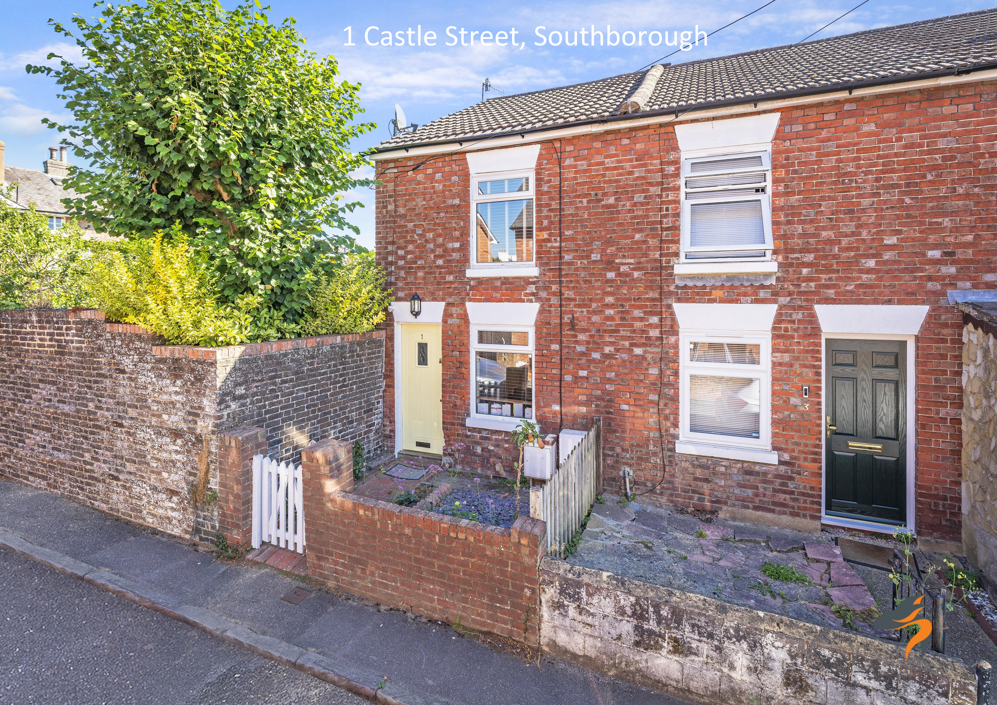
1 Castle Street, Southborough