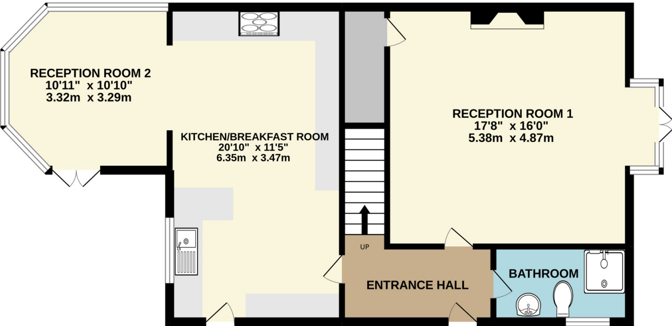
GROUND FLOOR 748 sq.ft. (69.5 sq.m.) approx.