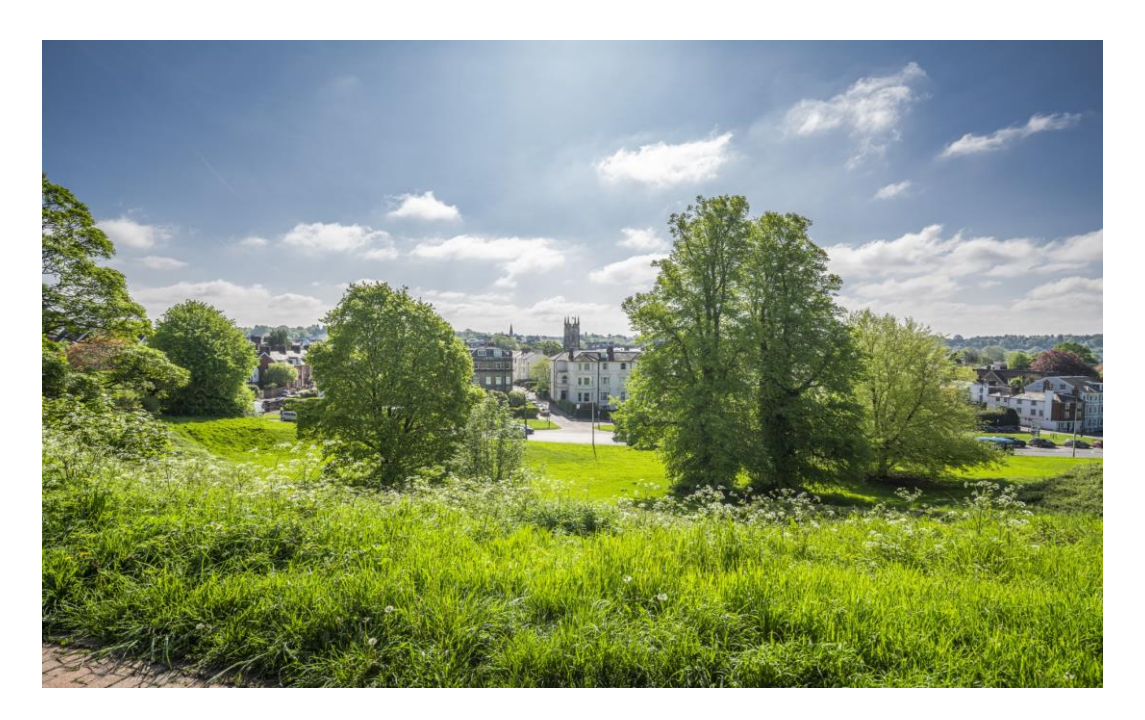
AREA INFORMATION: Tunbridge Wells, Kent

Tunbridge Wells, steeped in royal history and architectural heritage, also provides a wealth of modern day shopping, entertaining and recreational facilities.