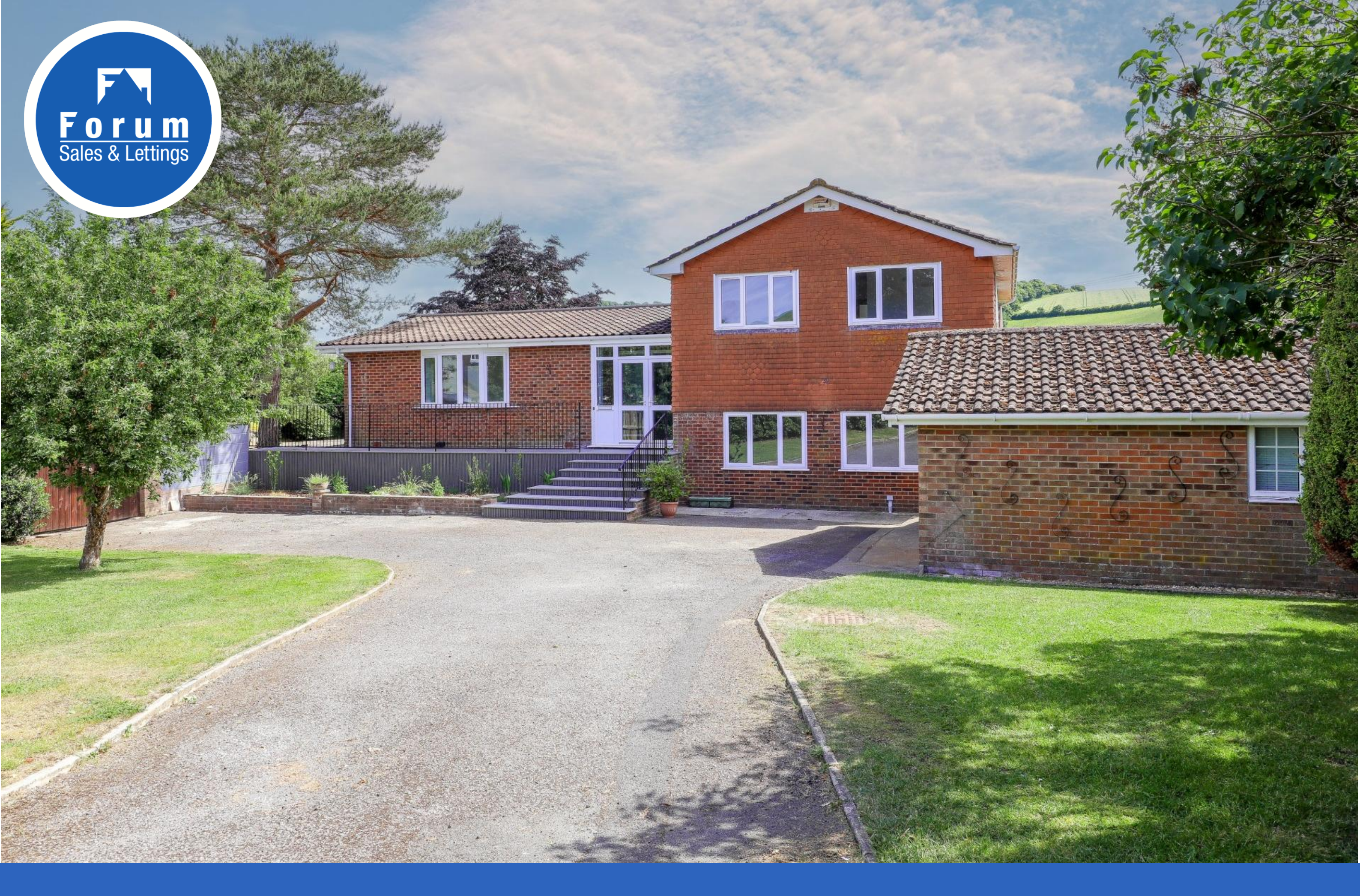
5 The Glebe, Shroton, Blandford Forum, Dorset, DT11 8PX