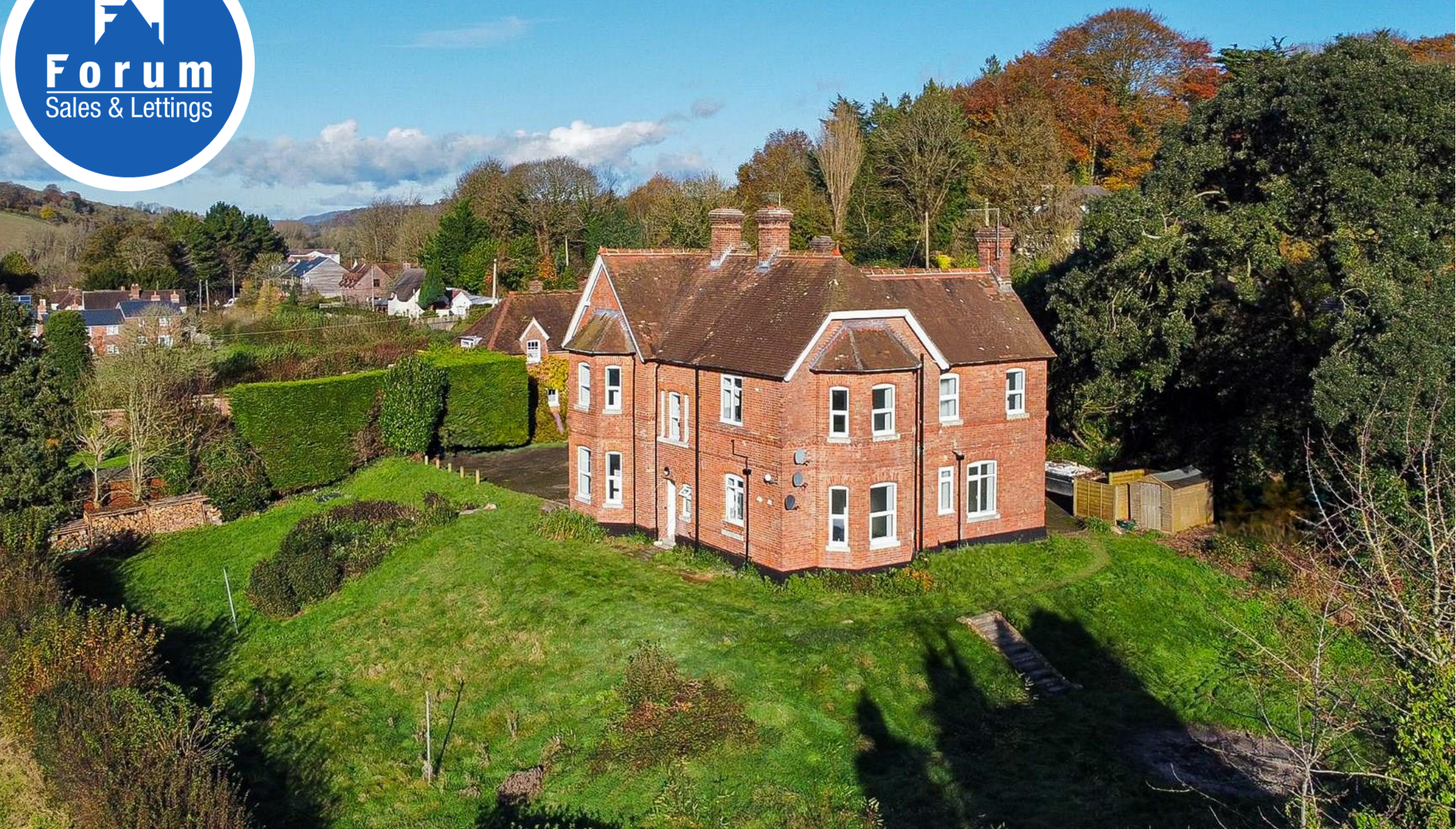
6 Stourpaine Lodge, Stourpaine, Dorset, DT11 8TD