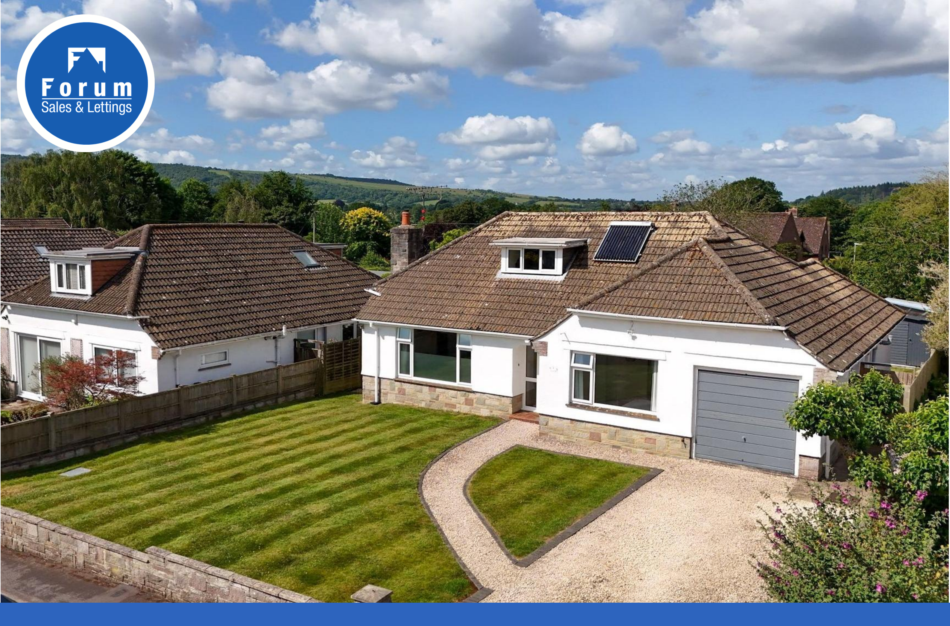
5 Knotts Close, Child Okeford, Blandford Forum, Dorset, DT11 8ES