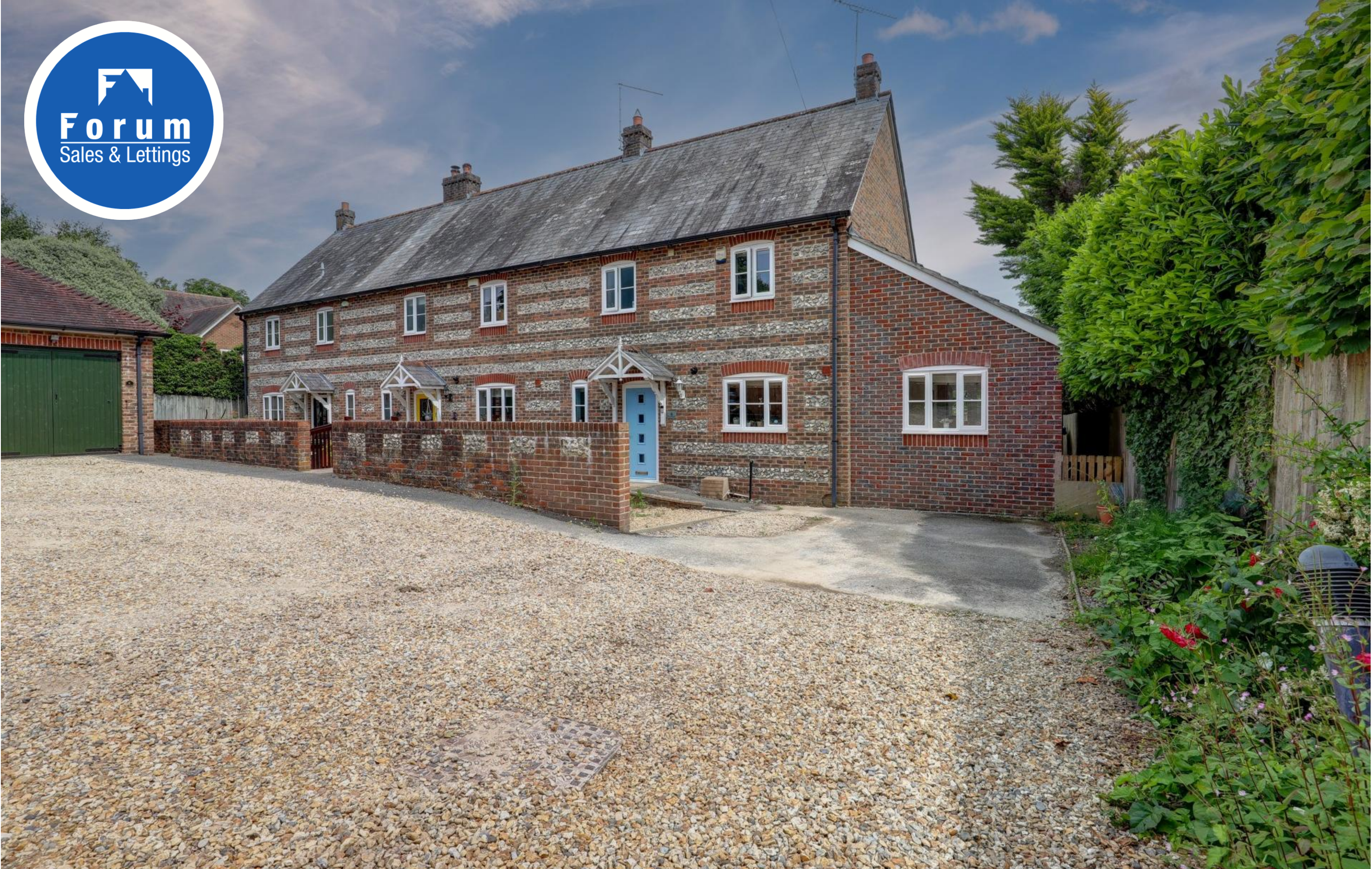
6 Parva Cottages, Charlton Marshall, Dorset, DT11 9LG