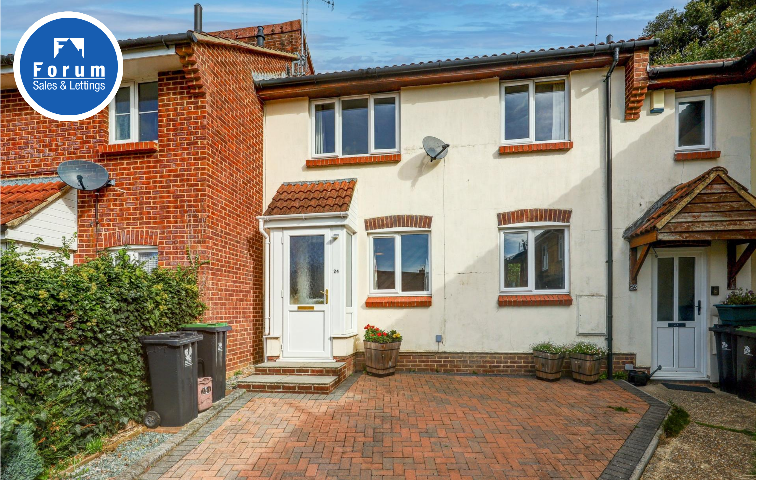
24 Eastleaze Road, Blandford Forum, Dorset, DT11 7UN