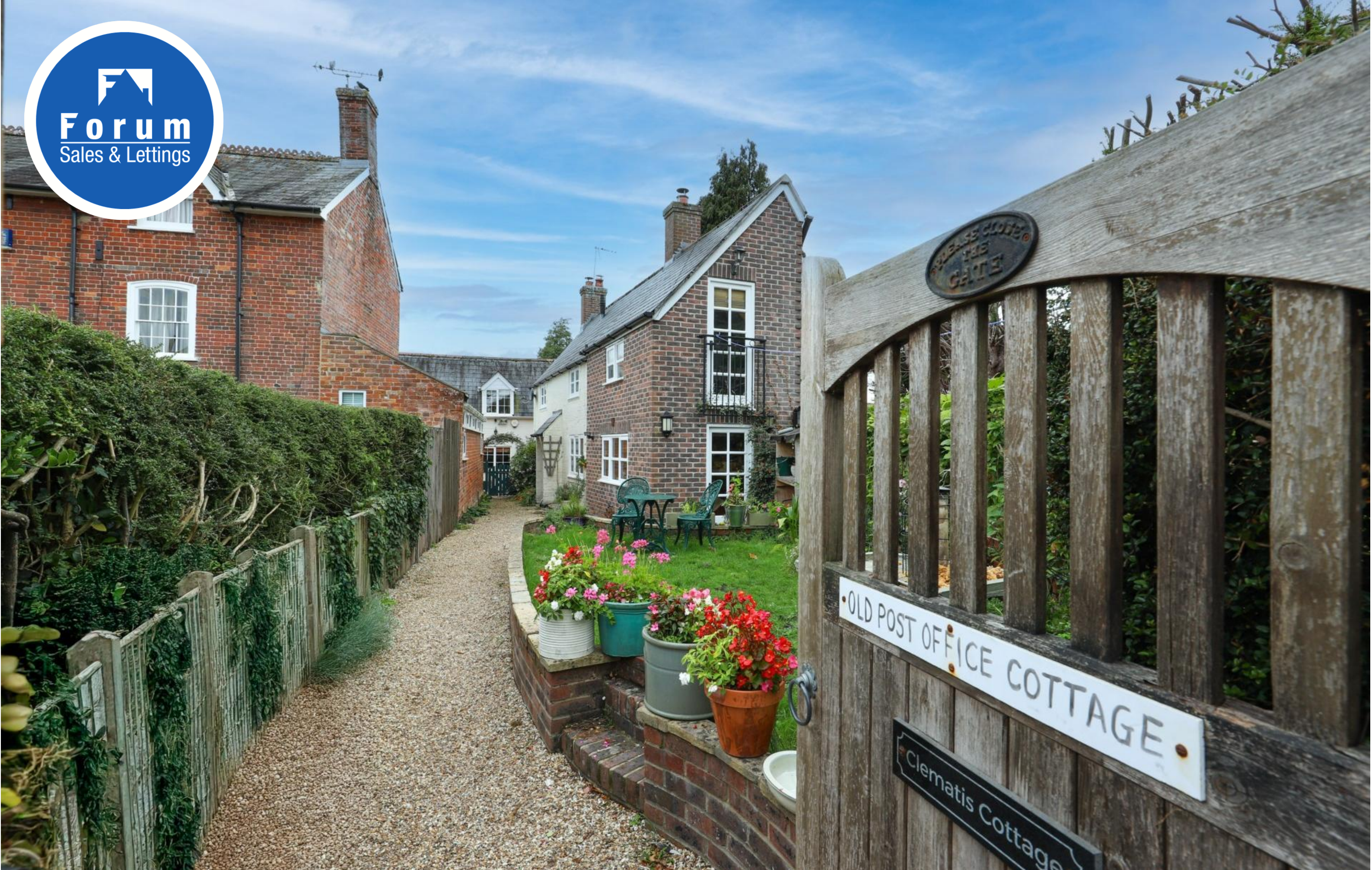
Old Post Office Cottage, High Street, Child Okeford, Blandford Forum, Dorset, DT11 8EH