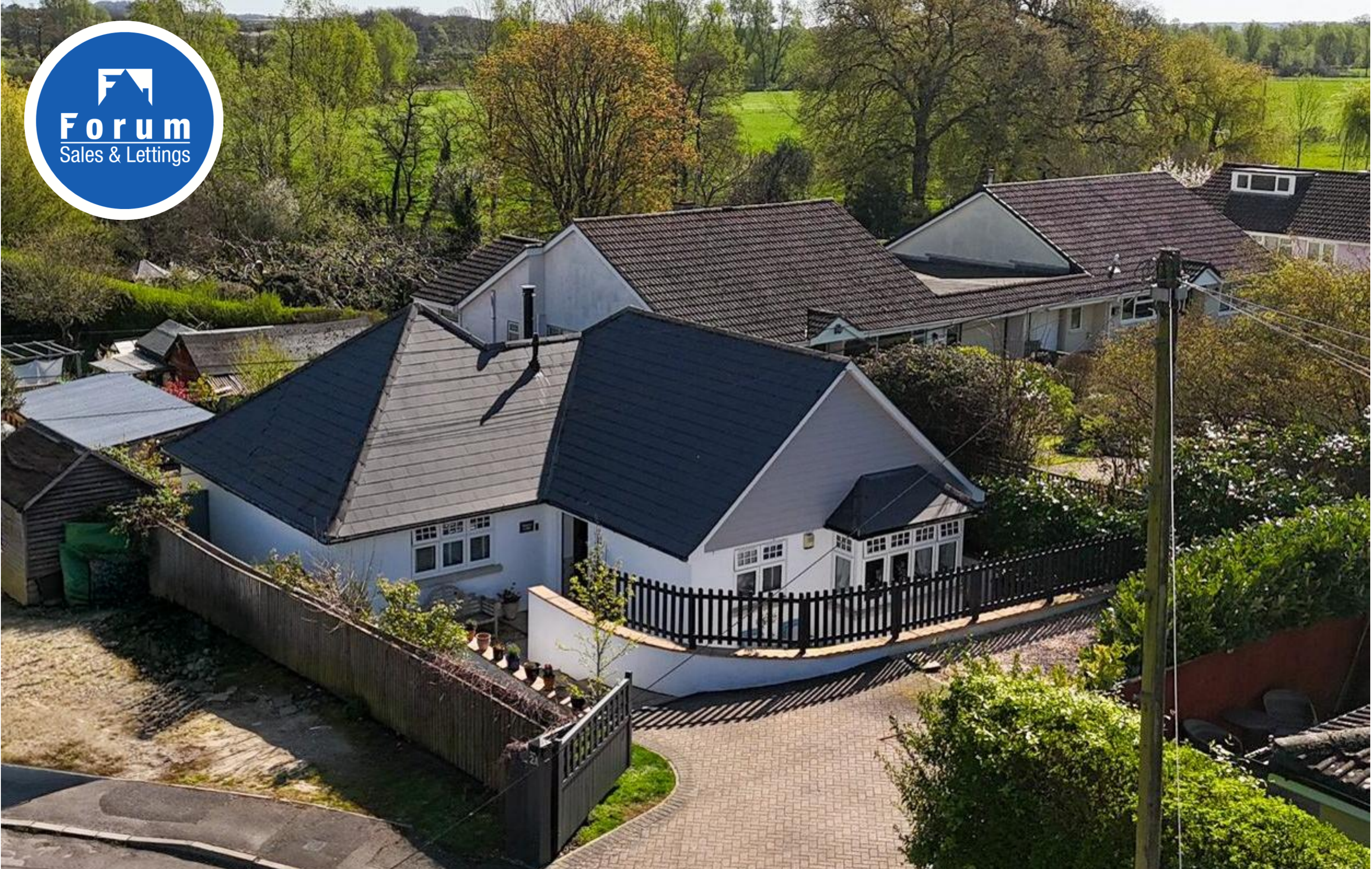
Slopers Lodge, 2a Slopers Mead, Spetisbury, Dorset, DT11 9DR