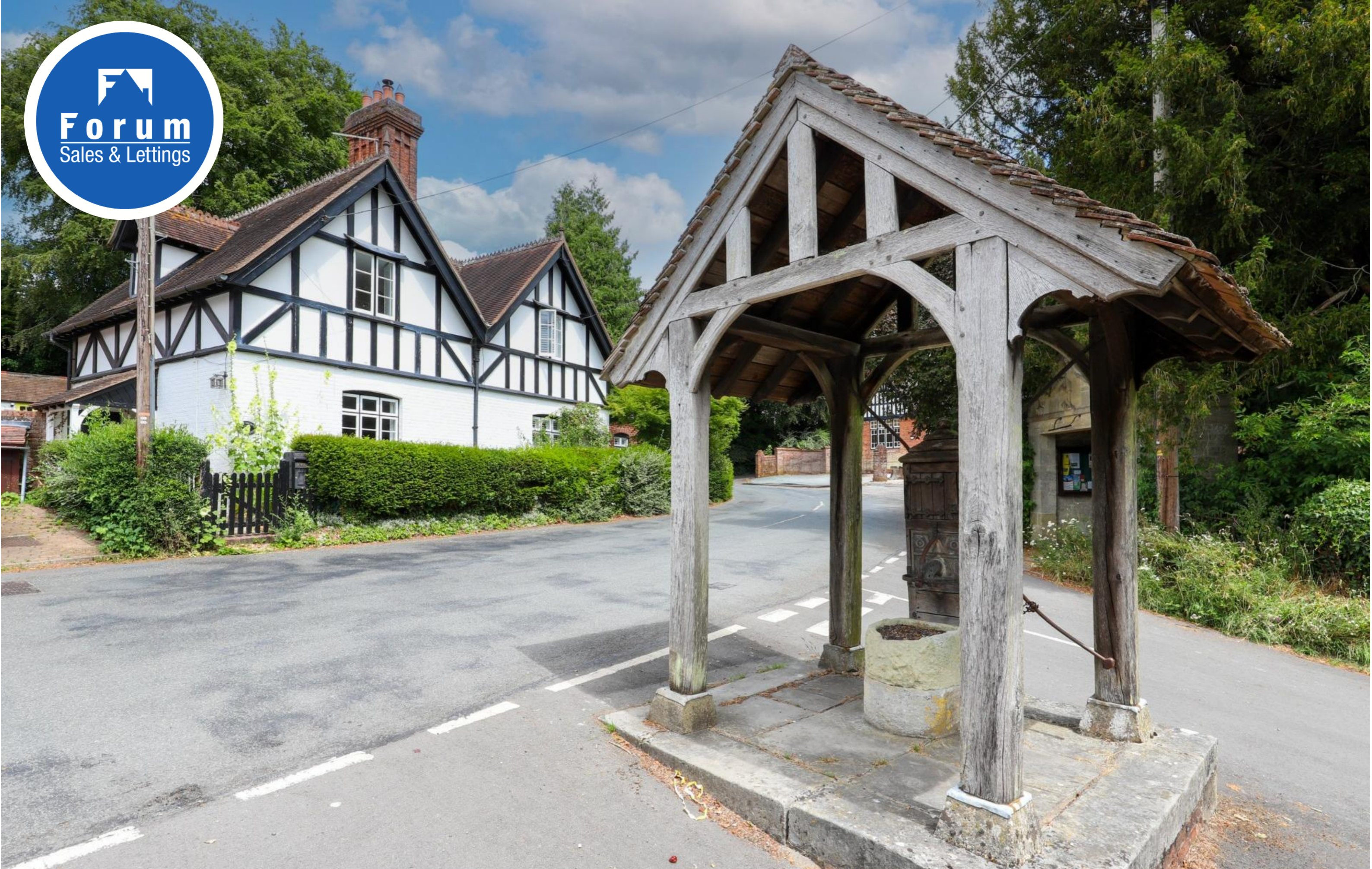
Pump Cottage, Higher Street, Iwerne Minster, Dorset, DT11 8LX