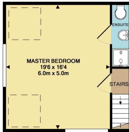
2ND FLOOR APPROX. FLOOR AREA 378 SQ.FT. (35.1 SQ.M.)

TOTAL APPROX. FLOOR AREA 1128 SQ.FT. (104.8 SQ.M.)