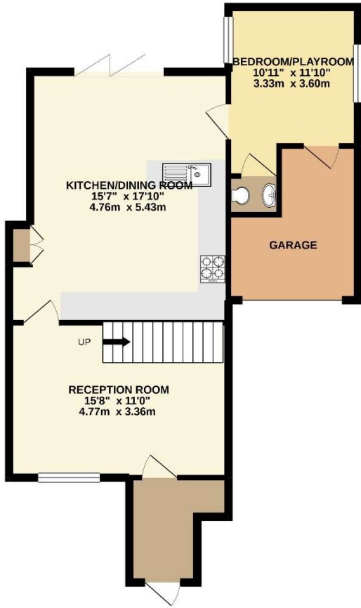
GROUND FLOOR 665 sq.ft. (61.8 sq.m.) approx.