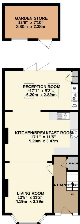
GROUND FLOOR 654 sq.ft. (60.8 sq.m.) approx.