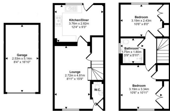
Ground Floor Approx 42 sq m / 456 sq ft

Approx Gross Internal Area 72 sq m / 773 sq ft