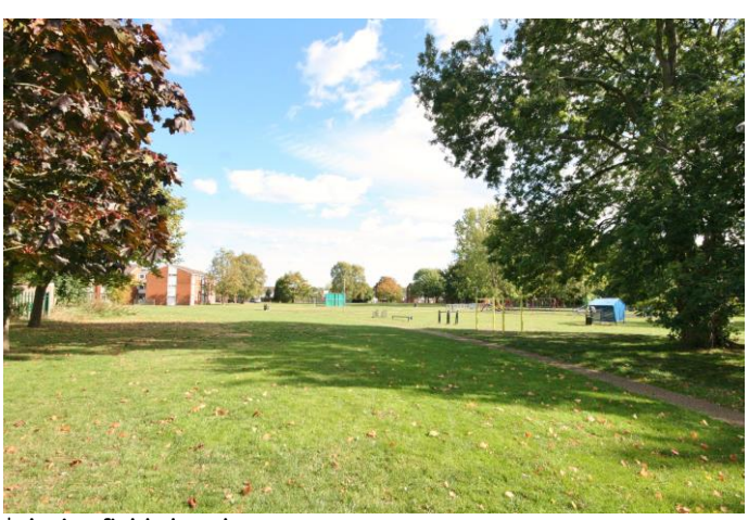
*playing field close by

EPC Summary: EER E (49/77) EIR E (48/61)