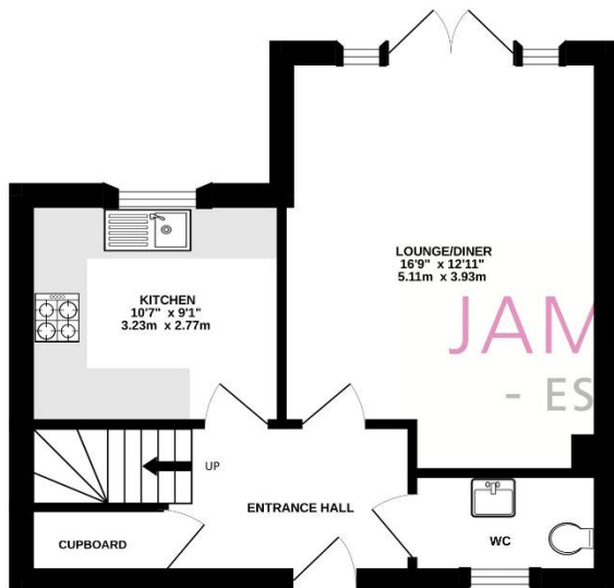
GROUND FLOOR 426 sq.ft. (39.6 sq.m.) approx.