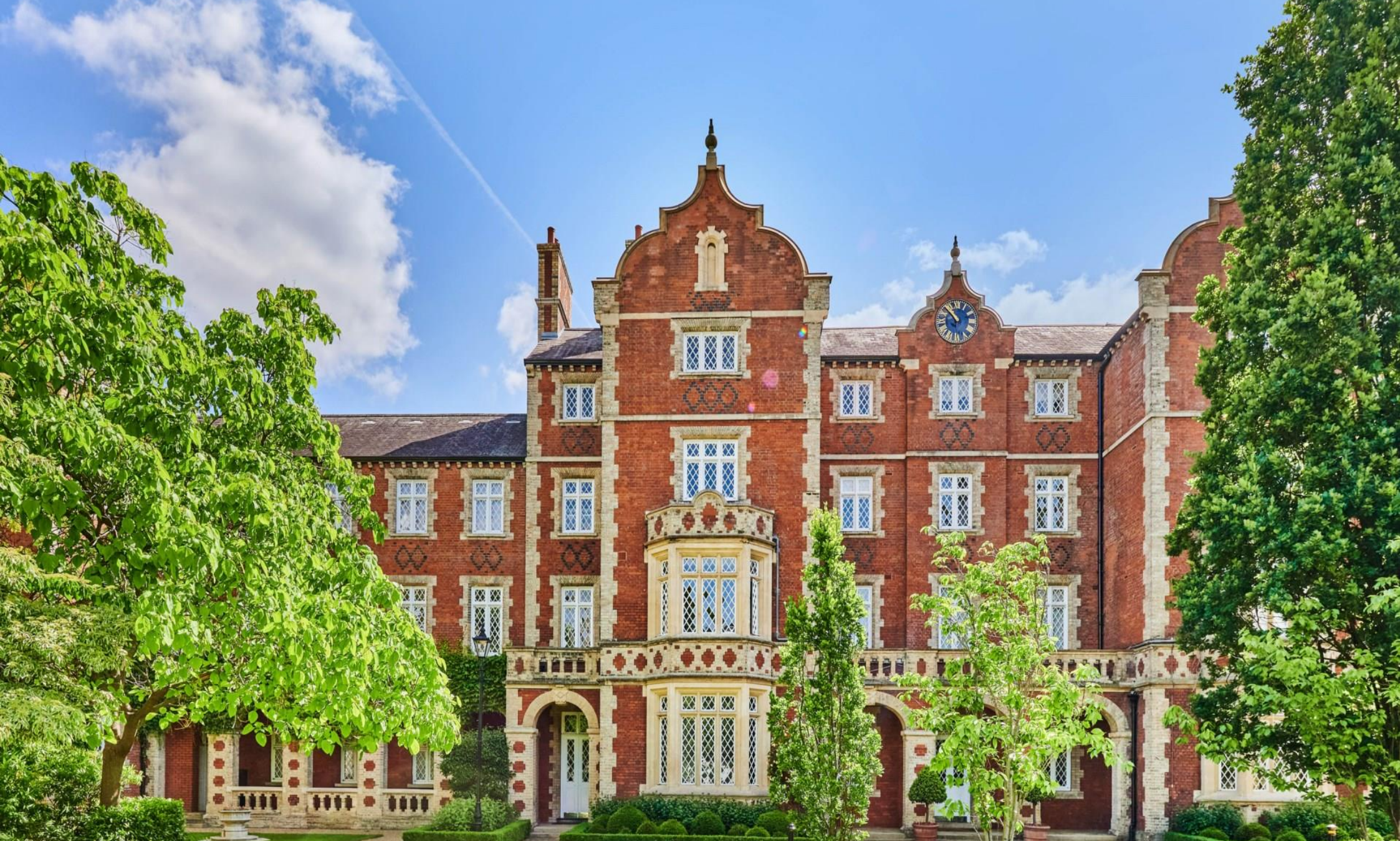
Stone Hall, Kensington Green, W8