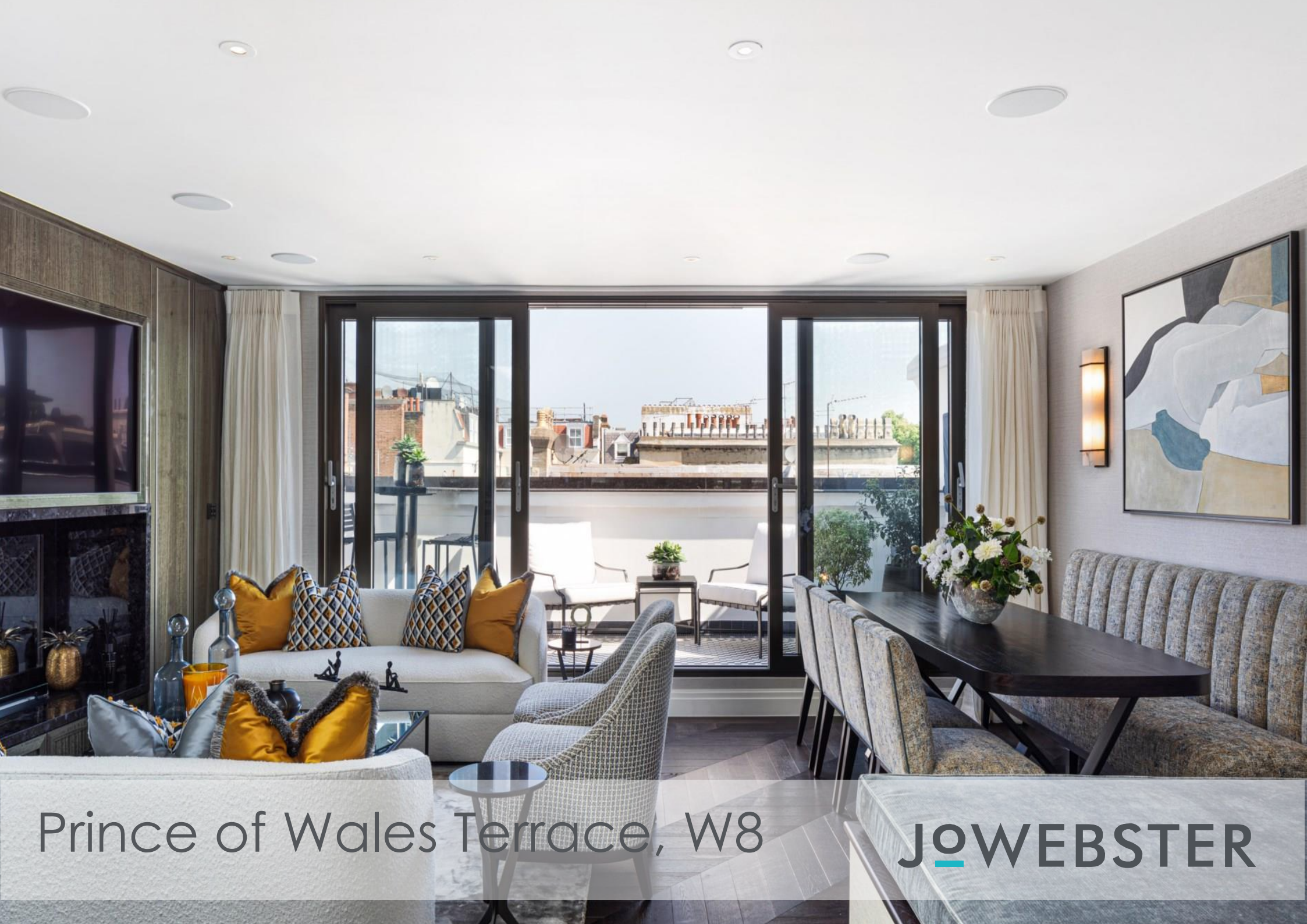
Prince of Wales Terrace, W8