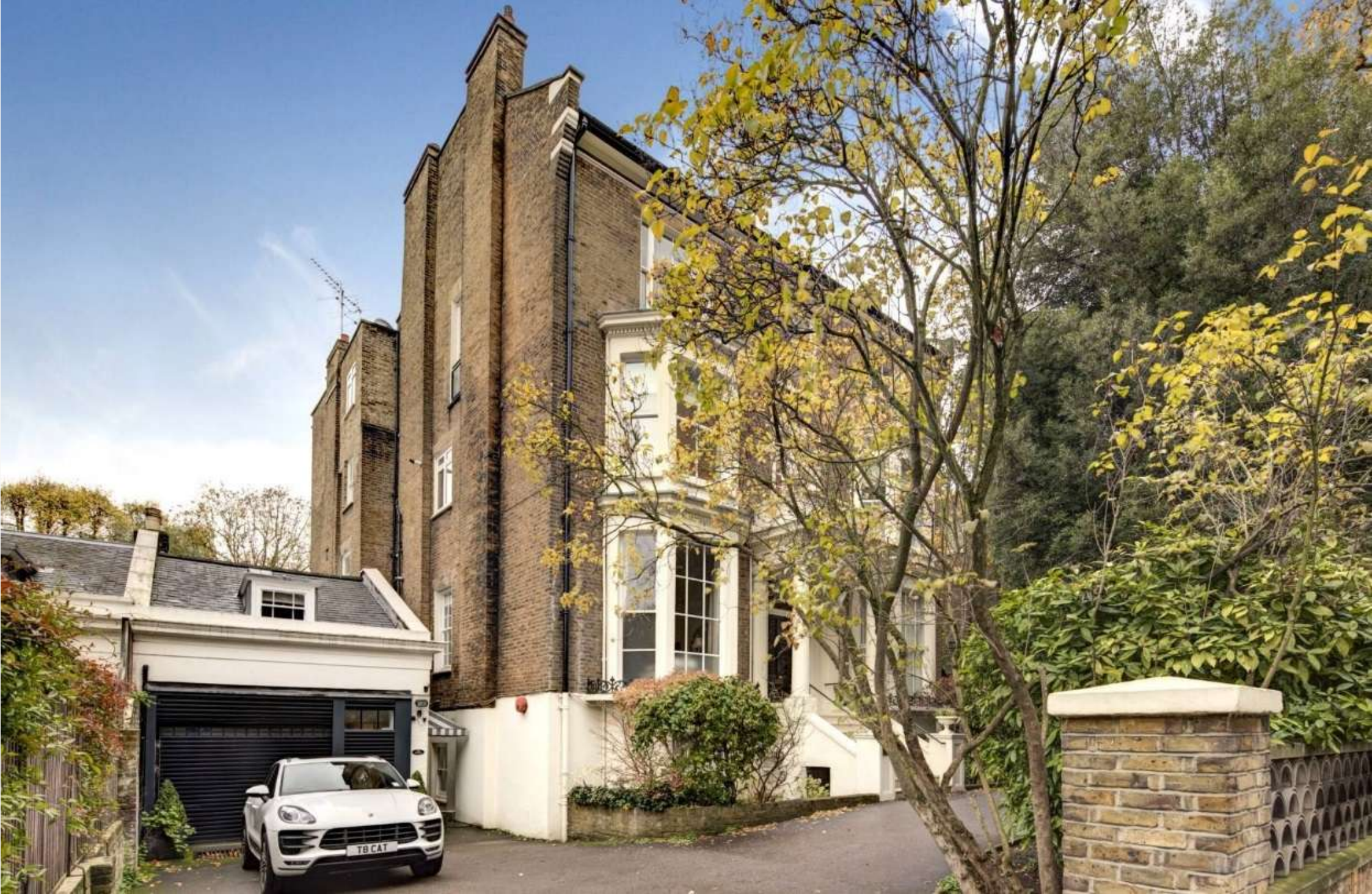
Flat 7, 86 Addison Road, Holland Park, London W11