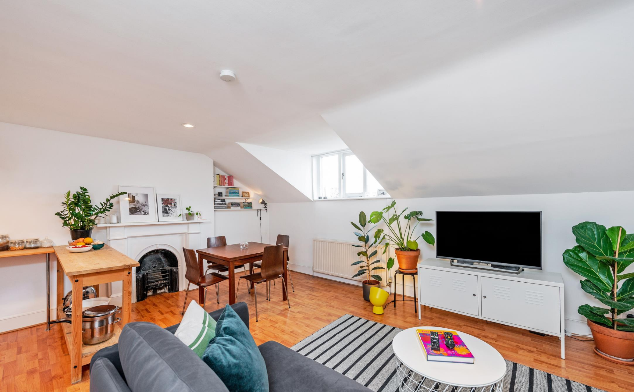
St James's Gardens, W11