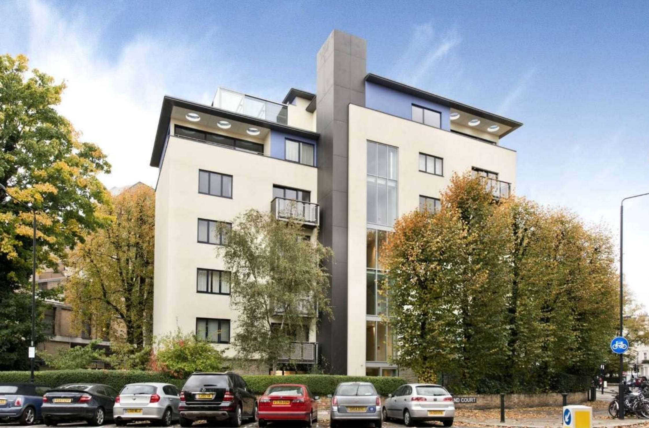
1 Parkland Court, Addison Road, Holland Park W11