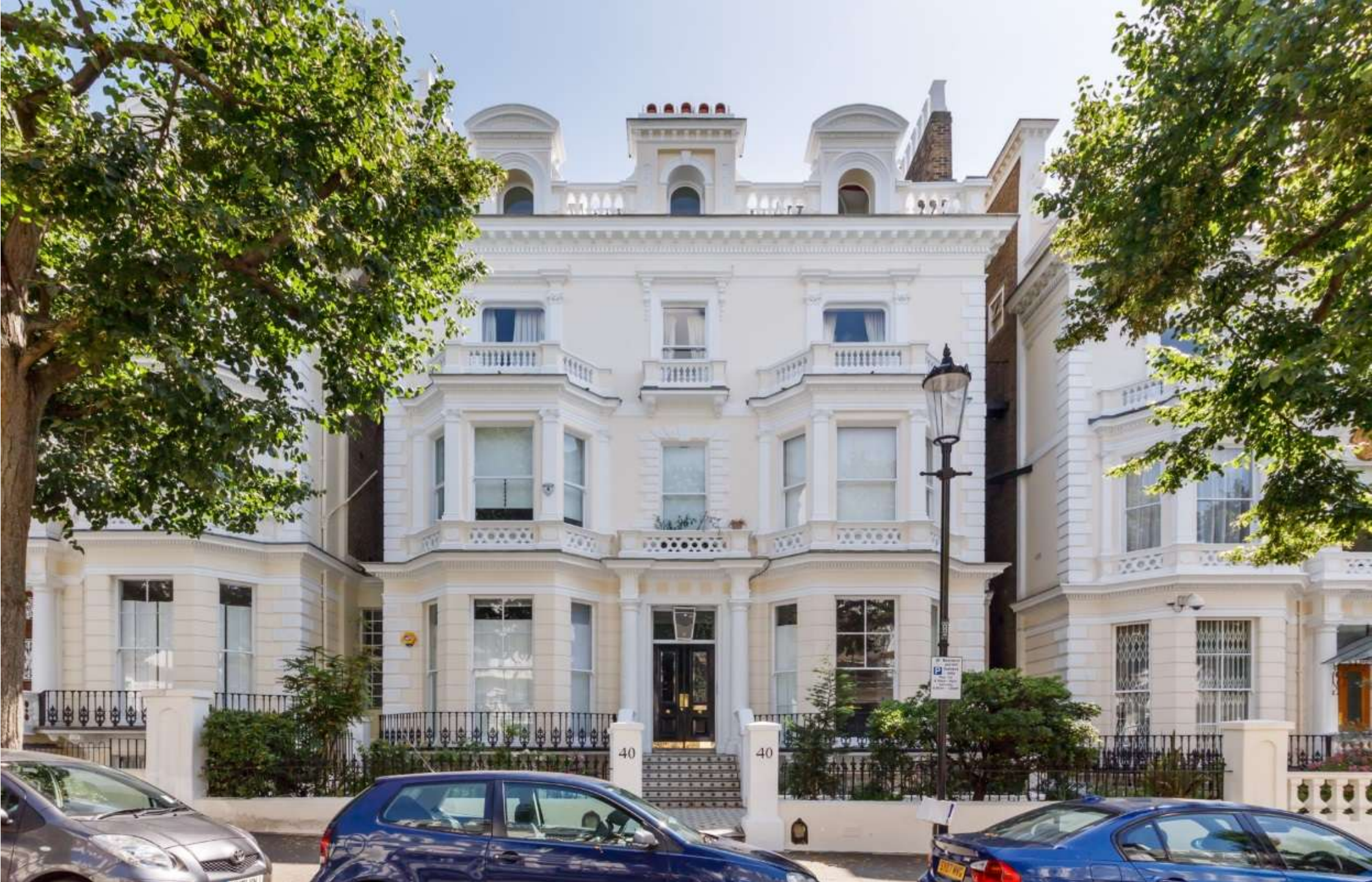
Flat 7 40 Holland Park, London W11 3RP