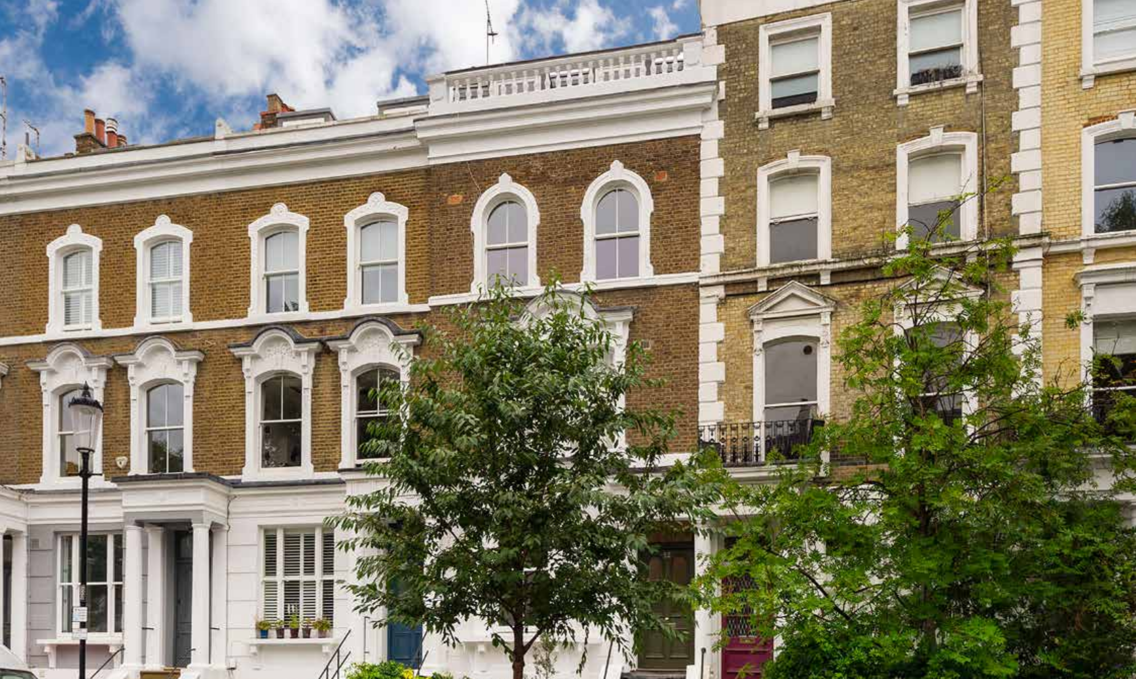
Blenheim Crescent, W11