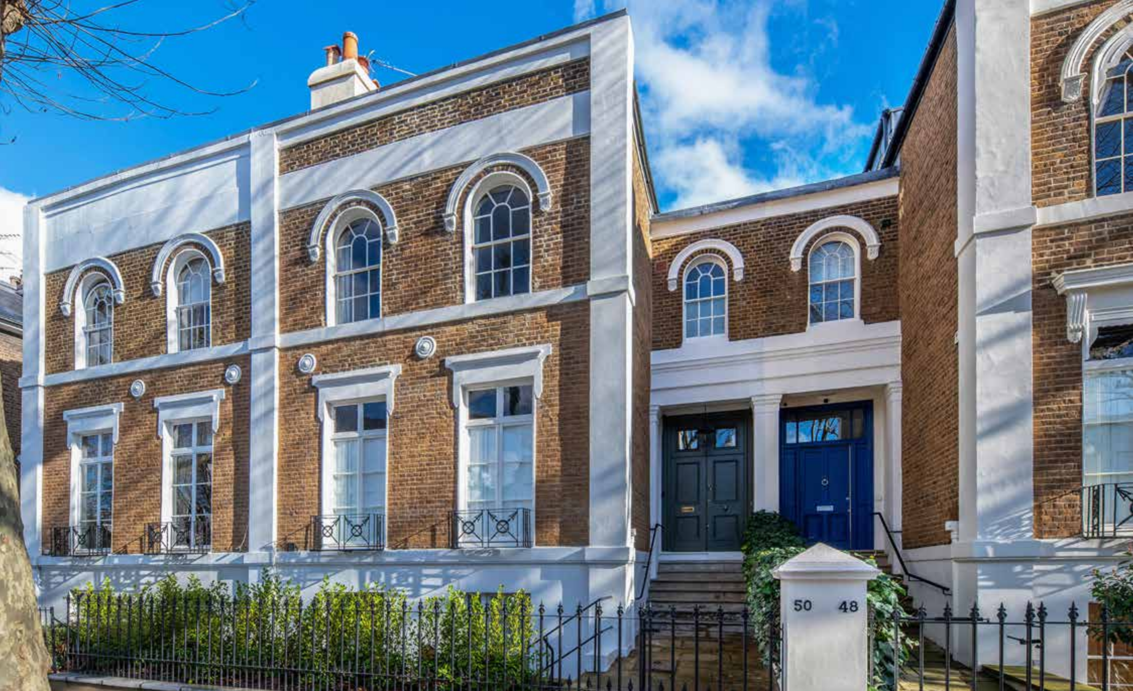
Addison Avenue W11